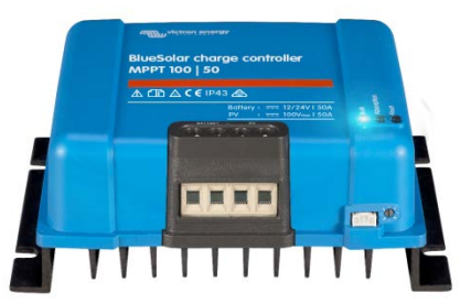
Solar Charge Controller MPPT 100/50