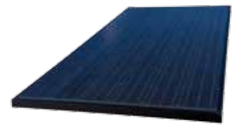
BlackBlack Also available with black backsheet and frame